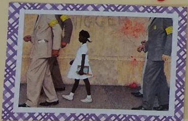
In 1964, Norman Rockwell painted The Problem We All Live With, a painting about Ruby Bridges attending the William Frantz Elementary School.

Opinion Writing Ruby Bridges should be celebrated during Black History Month. First Ruby was born during the Civil Rights Movement and participated in the movement by being a black student in a white school. Next while attending the William Frantz School, many people yelled at her and wrote signs with messages of hate for her to see. But Ruby kept going to the school and that should be celebrated. Then as an adult Ruby formed the Ruby Bridges Foundation to help people understand that people should be appreciated for their differences. This is definitely a reason to celebrate her because it shows that she never stopped fighting for equality. Last but not least, President Obama displayed the Norman Rockwell painting of Ruby in the White House. I think that if a president thinks Ruby should be celebrated then we all should, too! Now you know why I think Ruby Bridges should be celebrated during Black History Month.